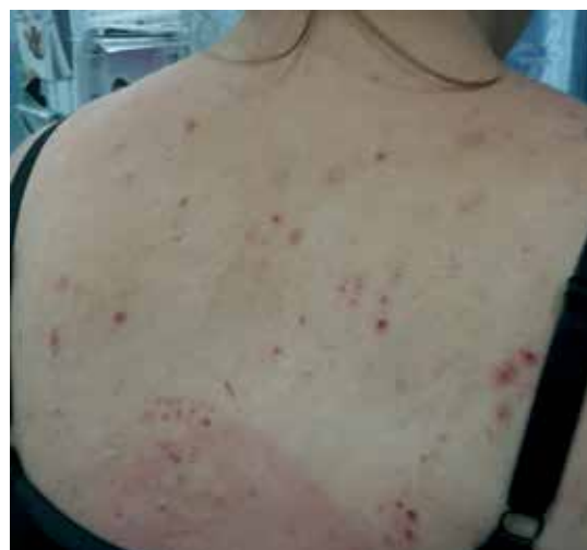
Impact of scratching

Given that women can be diagnosed with ICP as early as the first trimester, and that 20% of women will itch in pregnancy, some health professionals are concerned about over testing. There is no easy way to distinguish women who simply have pregnancy pruritus from those who have ICP, although the nocturnal nature of the itch in ICP may be a marker. It is possible that the combination of measuring the pruritic agents in conjunction with bile acids would be a better way of identifying women with ICP, but this needs further research and to be cost-effective. For now,